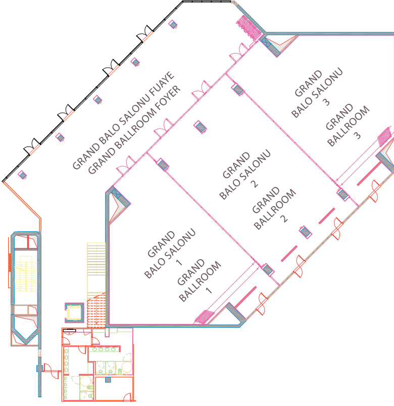
Grand Balo Salonu Grand Ballroom